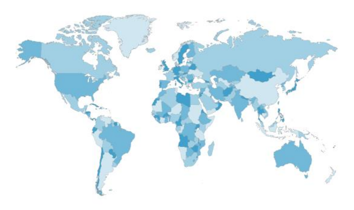
HAJJ & UMRAH PLAN POLICY WORDINGS